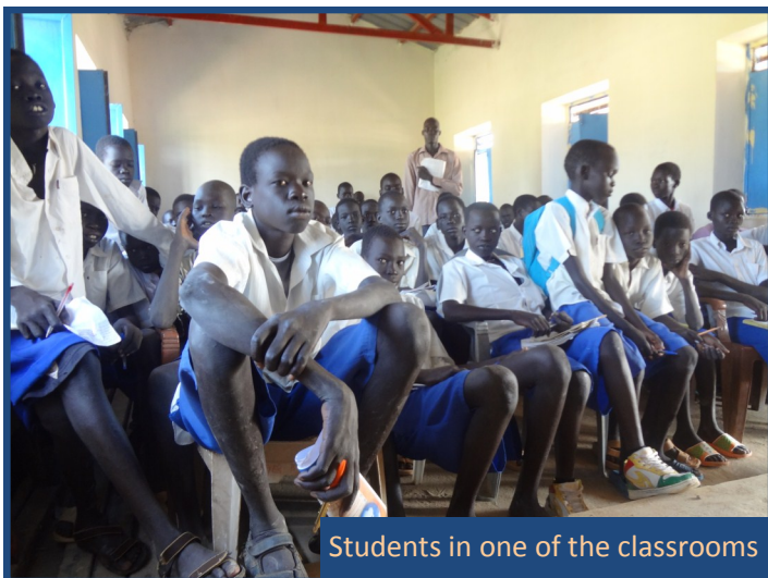
Students in one of the classrooms