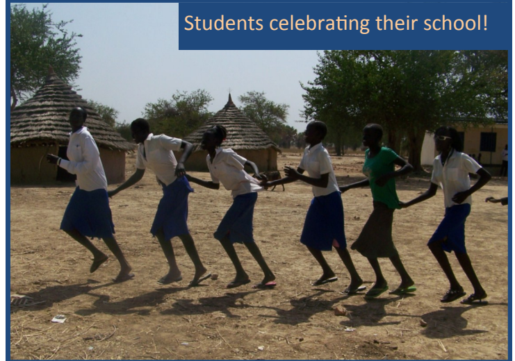
Students celebrating their school!