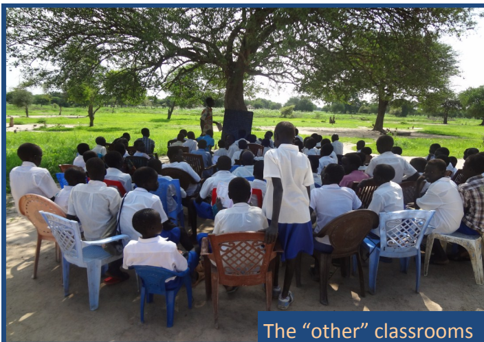
The "other" classrooms