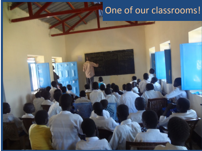
One of our classrooms!