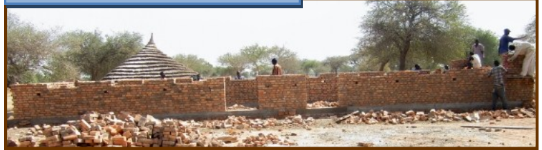
2012—After BMIS Donors

2012 was a banner year for BMIS! Our team traveled to South Sudan in January to negotiate a contract with our builder. The first set of four classrooms was completed in May with the help of donations to a special fund drive from our generous supporters. Students fill the first rooms, carrying their plastic chairs from their homes. Attendance records show a significant increase in attendance of girls at our school. See reverse for details.