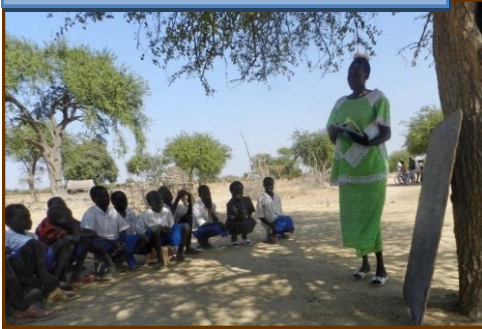
2011—Before BMIS Donors

2012 was a banner year for BMIS! Our team traveled to South Sudan in January to negotiate a contract with our builder. The first set of four classrooms was completed in May with the help of donations to a special fund drive from our generous supporters. Students fill the first rooms, carrying their plastic chairs from their homes. Attendance records show a significant increase in attendance of girls at our school. See reverse for details.