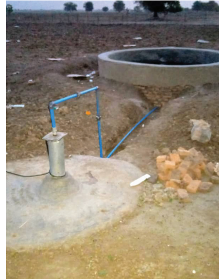
A work in progress and close up of the underground brick tank and pipe connection to the well

Village chiefs are the only people who have the authority to grant land for projects in their villages. A few years ago, Sebastian requested land for the women in Mayen Abun for a community garden. These women watered their garden by carrying a jarkcan or jug, on their heads filled with five gallons of water. A year later, Linda Werts and Presbyterian Women dedicated boot pumps to ease this burden. The women filled their jarkcans by operating these pumps with their feet much like an elliptical machine works.