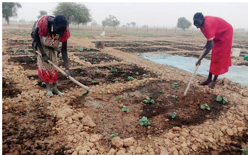
Starting the planting of the gardens, December 2019