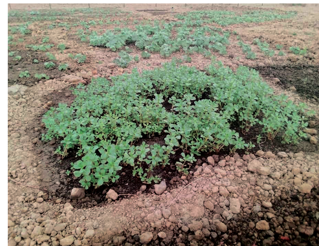
The same garden at the end of February 2020!