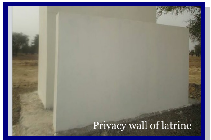
Privacy wall of latrine